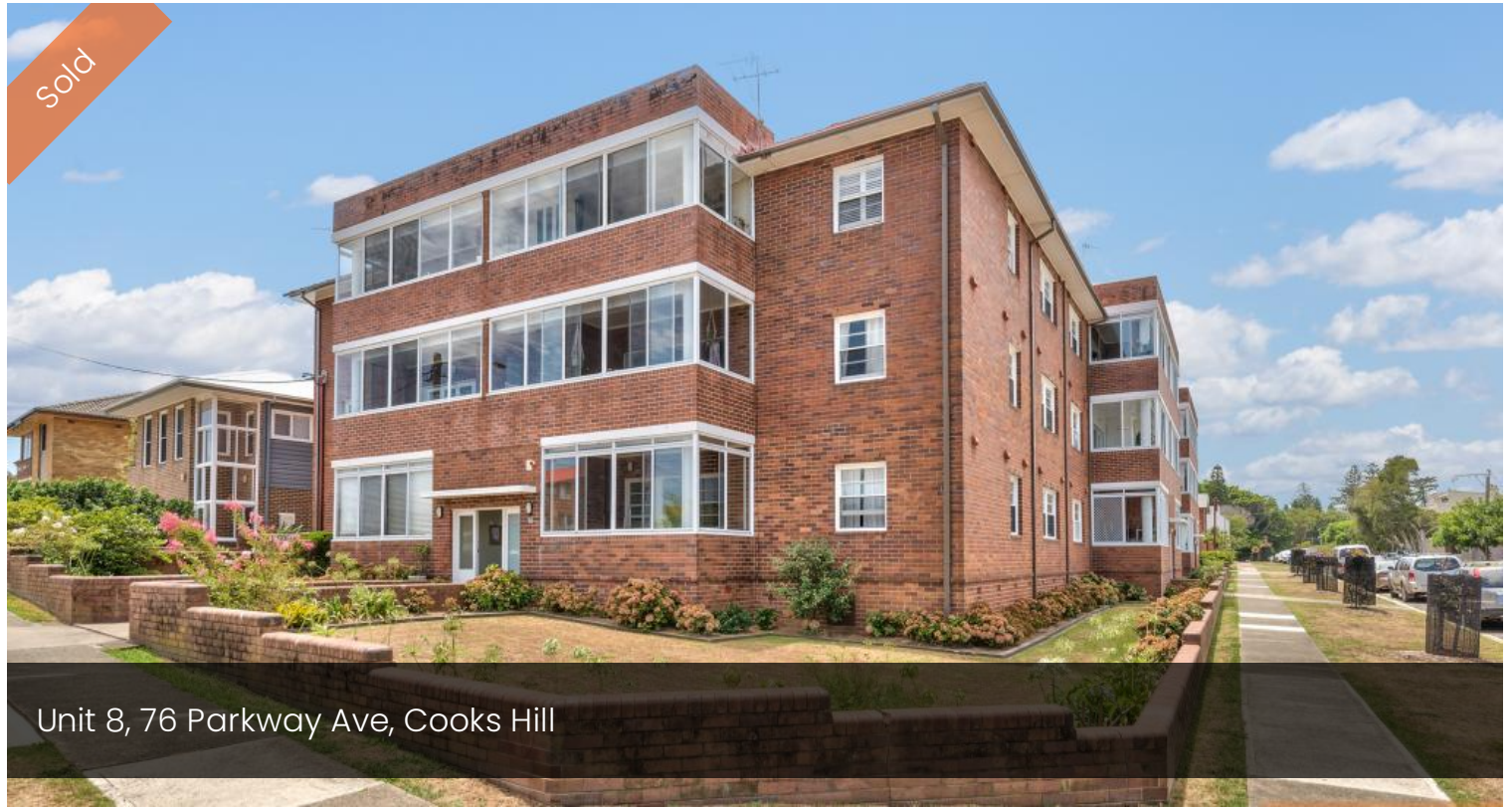
Unit 8, 76 Parkway Ave, Cooks Hill