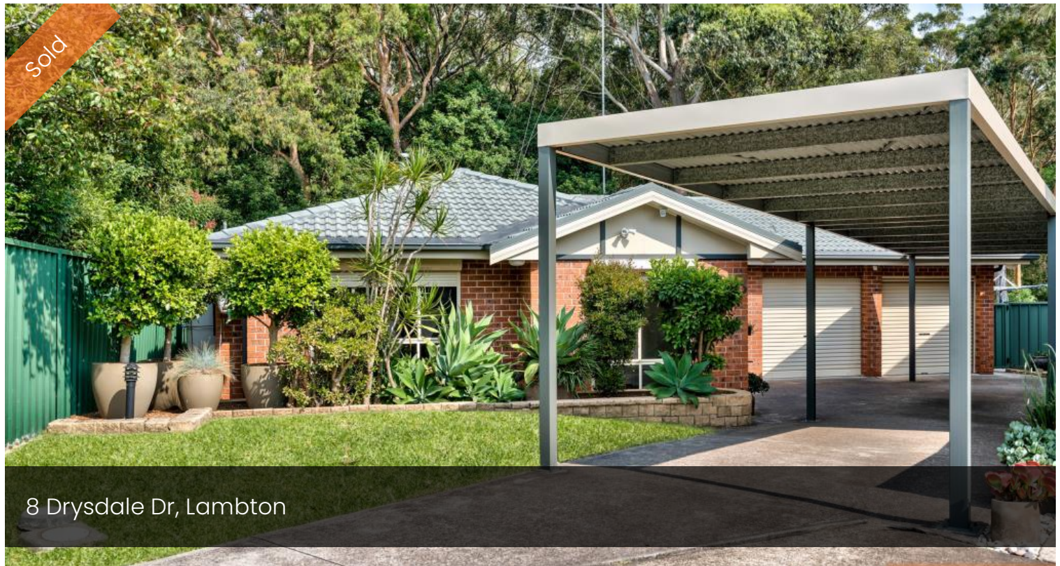
8 Drysdale Dr, Lambton